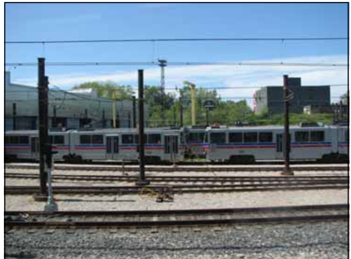
Cleveland Light Rail