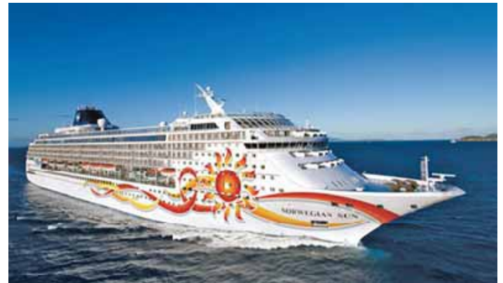
NCL's Norwegian Sun 9 day Baltic Capitals Cruise May 17-26, 2011

port charges and taxes. All it takes right now to book either one of these cruises is a deposit of only $250 per cabin; that's right! $250 holds the cabin!