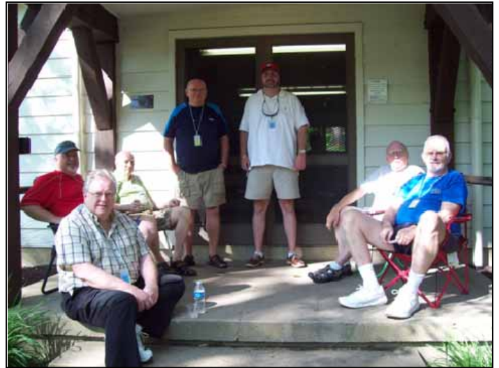
Columbus OH PT'ers relax during an excursion and picnic in Lancaster OH