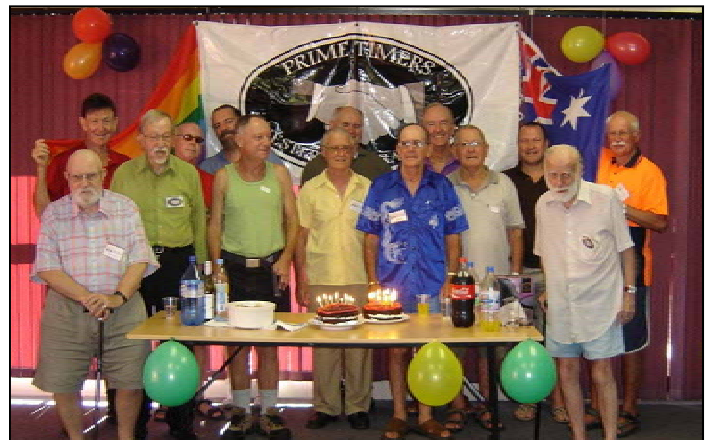
Prime Timers Western Australia (Perth) at a recent meeting