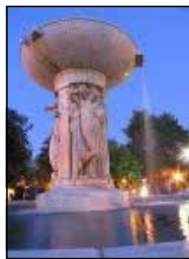
DuPont Circle in Washington DC.

WASHINGTON DC: DC is noted for its large gay community. The most well known neighborhood is Dupont Circle where Prime Timers of DC meet Wednesdays at the Dupont Italian Kitchen Restau-