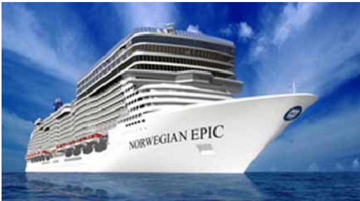
NCL's Epic 7 day Western Caribbean Cruise Jan 8-15

We also want to give you an early heads up! We will be booking our April 2012 Amazon River cruise as soon as its available. It is aboard Princess Cruises. Why such an early heads up? This is the only cruise of this kind and it sells out very quickly. The cruise will start in Manaus, Brazil and end in Ft. Lauderdale; air prices one-way to Manaus are currently very, very low.