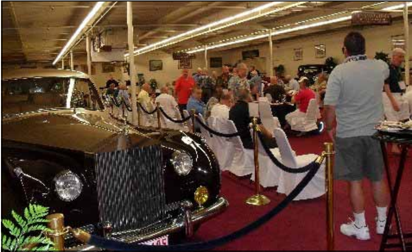
The Las Vegas opening reception at the Imperial Palace Auto Collection

by Donald Edgecomb - San Antonio Chapter