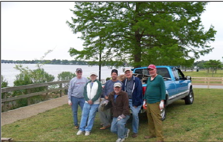
Tidewater PT'er Clean Up Crew in Portsmouth City Park