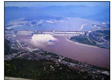
Three Gorges Dam

Hong Kong was crowded and rushed but we enjoyed venturing out on our own finding meals in little places where no one spoke English. The crowds and neon lights dazzled us. Everyone was in a great hurry.