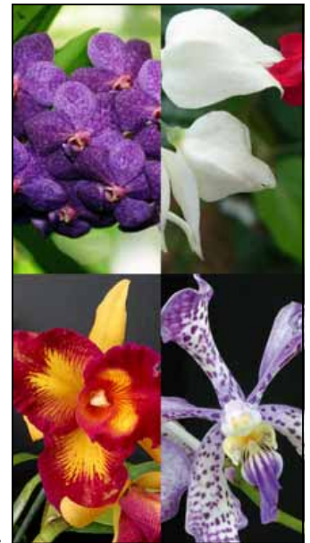
Some of the great flowers at Marie Selby Botanical Gardens

Travel is easy to Sarasota, with several major airlines providing service. The airport code is SRQ for those of you who like to book your own travel online. For forms and additional detailed information, go to www.primetimerssarasota.org .